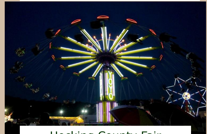
Hocking County Fair September