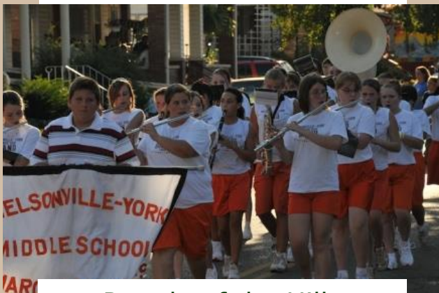
Parade of the Hills August