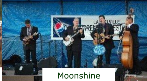
Moonshine Festival Memorial Day Weekend