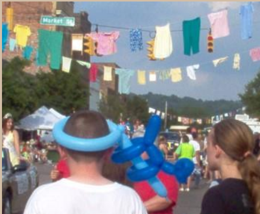
Washboard Music Festival June

Select a Festival and we can build a custom itinerary which includes a day at the festival, adventures and unique accommodations.