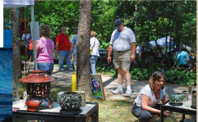
Lilyfest Art & Nature Festival July