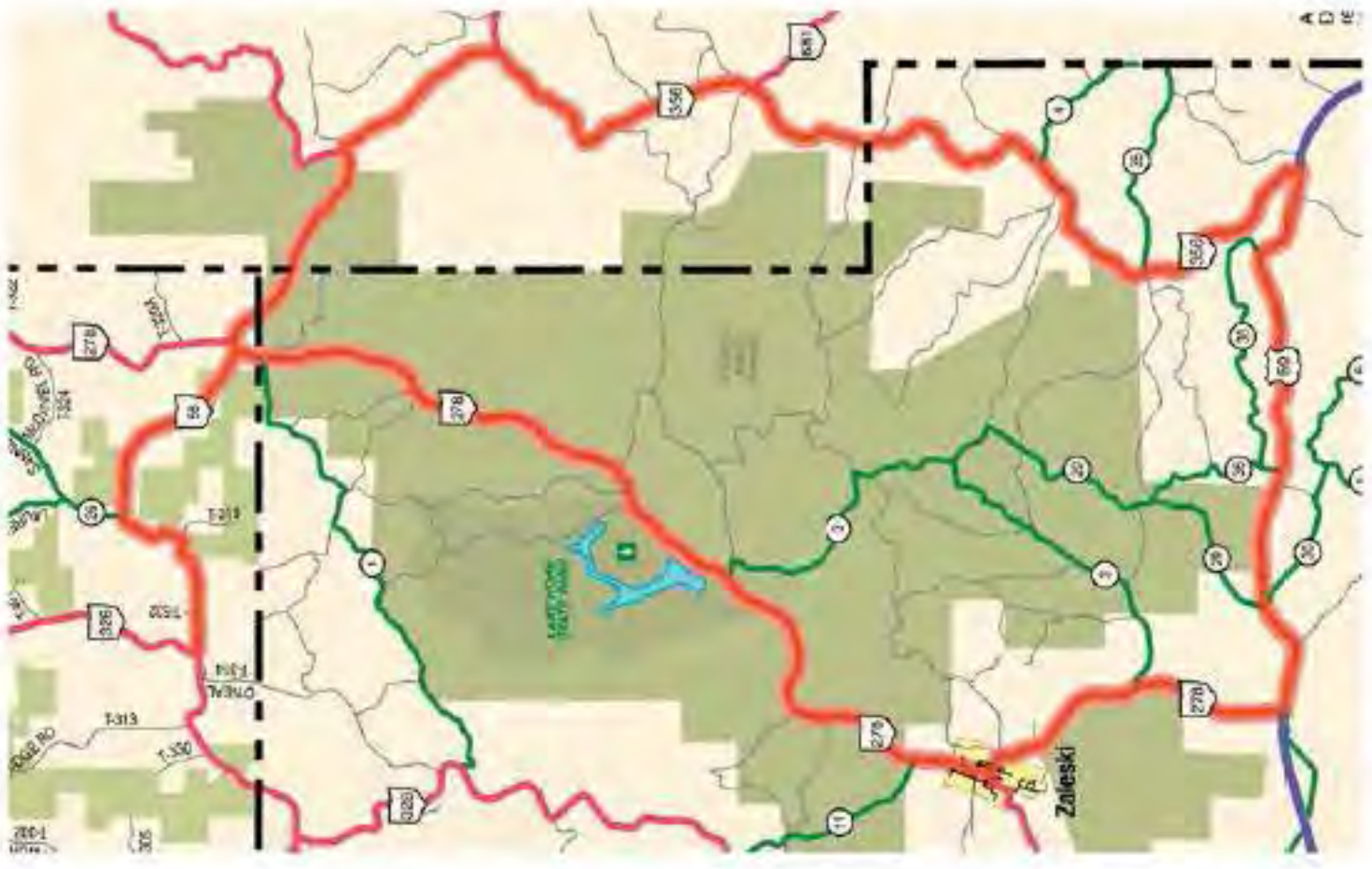
Lake Hope Loop